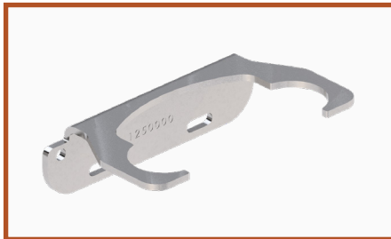
Mid Support Bracket